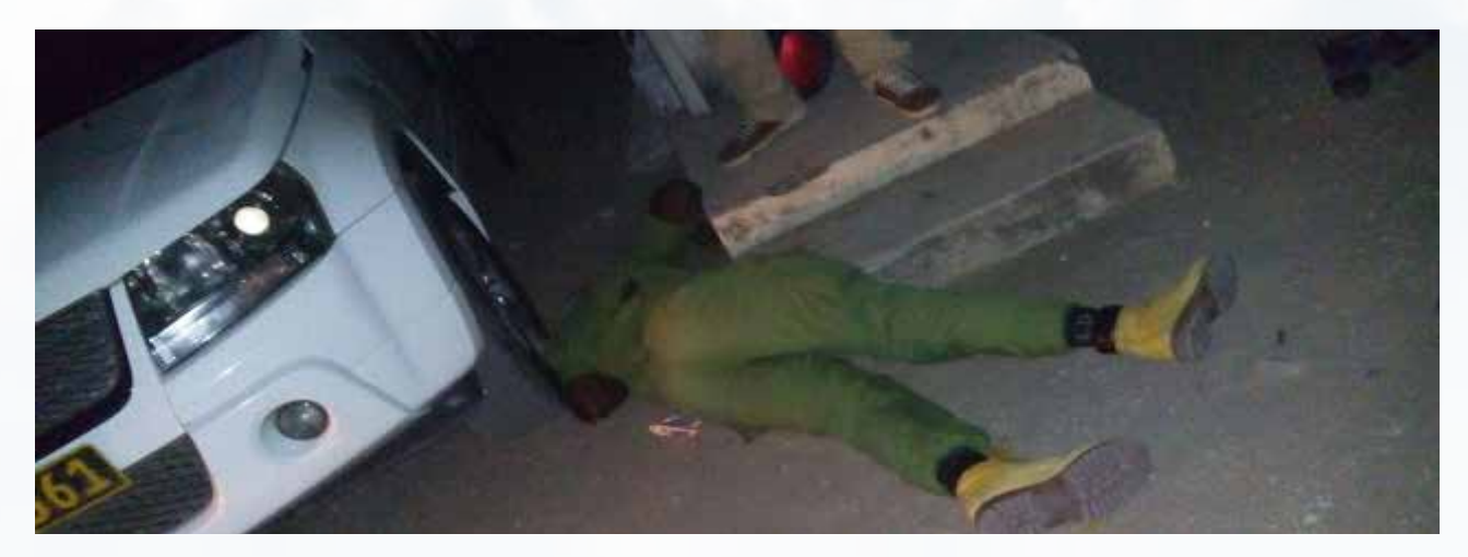
The body of a Policeman who was shot to death by bandits at Sitaki Shari Police post in Dar es Salaam in 2015.

Police officers do receive allegations of human rights violation on a daily basis. Just like other HRDS, they fight all sorts of criminal conducts, brutality, and gender based violence as well as restore peace where the security of people is at risk. It is therefore, very clear that police and human rights actors play almost a similar and mutual role in the field of human rights.