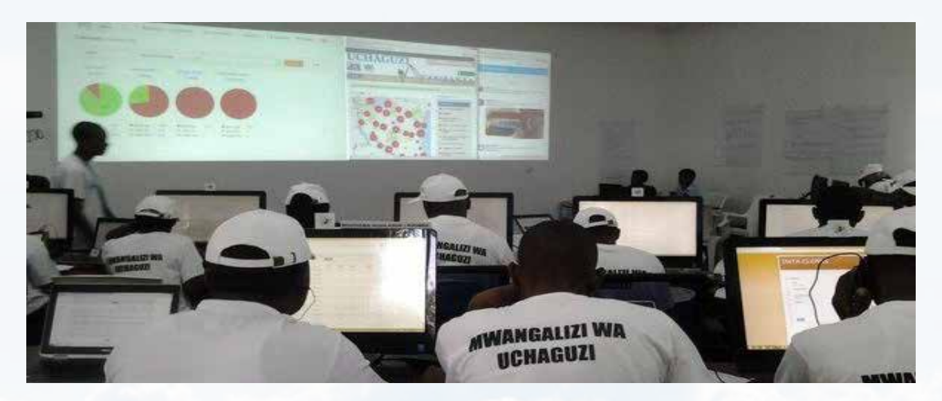
Election observers busy at the TACCEO Election Hub before they faced the wrath of the Cybercrime Act.