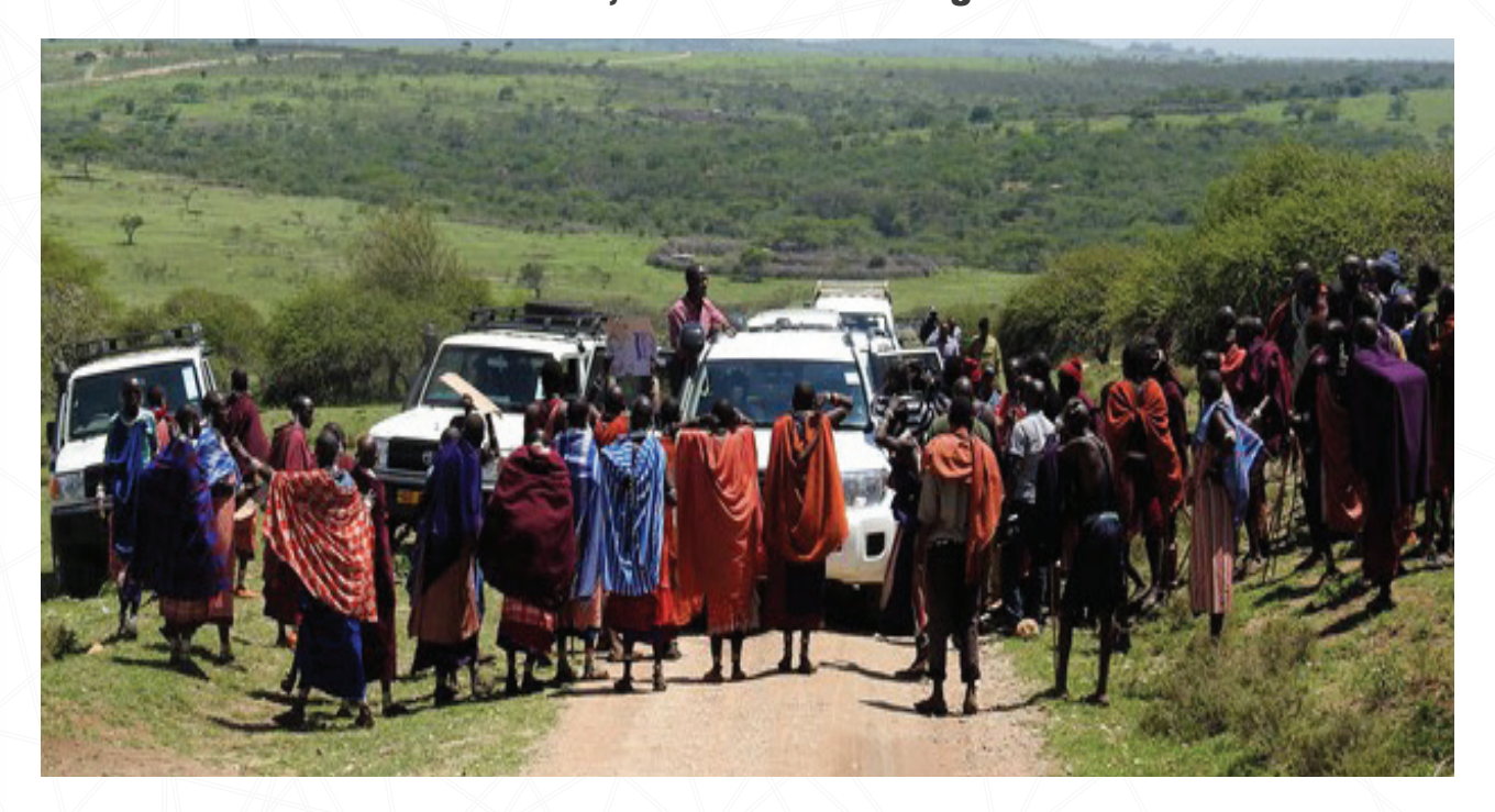
Picture 1 Natives of Loliondo blocking the expedition of the Minister for Natural Resources and Tourism, Prof Jumanne Maghembe

Citizens of Loliondo blocking the Minister for Natural Resources and Tourism to have him listen their concerns about land conflict in Loliondo.