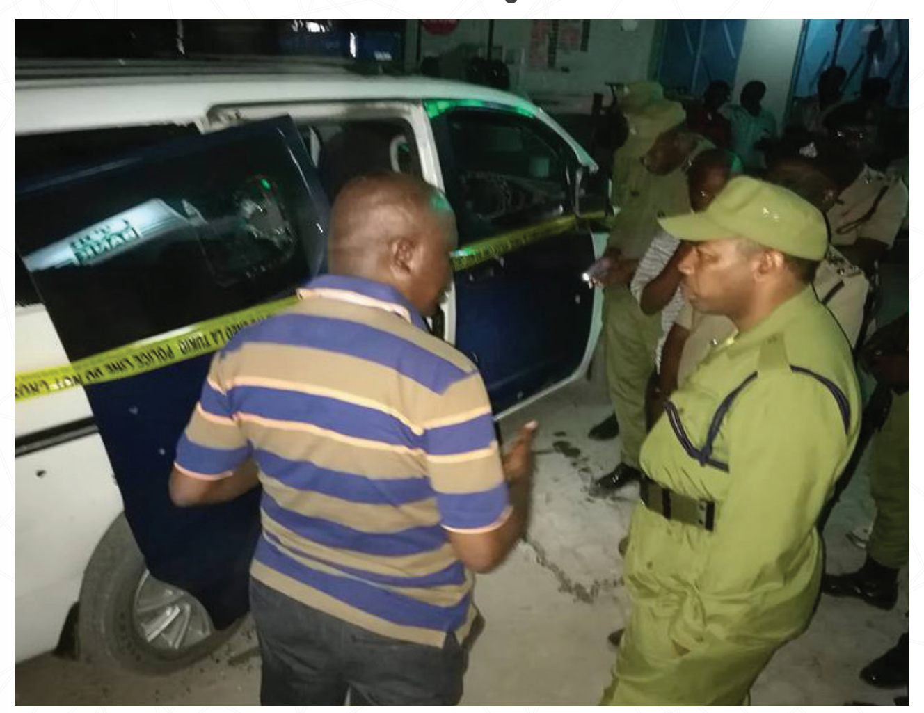
Picture 3: Minister of Home Affairs visiting the scene of the incident.

Minister of Home Affairs, Mwigulu Nchemba visiting the site where the four police officers were killed.