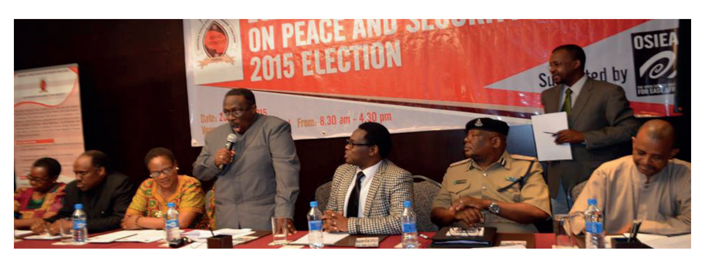
Pictured above are Officials from CSOs, ZEC, NEC, ROPs, IGP reps, PCCB and Council of Political Parties during one of the election stakeholders' dialogues in 2015 conducted by THRDC

Furthermore, the dialogue formed a National Peace and Security Committee composed of all key election stakeholders such as The Police Force, National Election Commission-NEC, Zanzibar Election Commission-ZEC, the Office of Registrar of Political Parties, and Political parties, Religious Institutions, Commission for Human Rights and Good Governance, Media Institutions and Civil Societies.