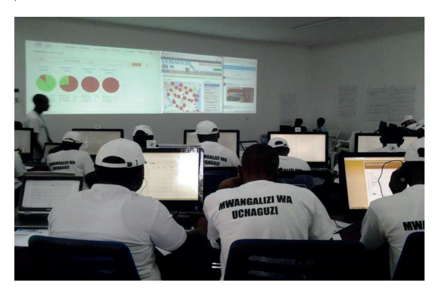
A picture of the TACCEO Observation Centre before the attack

THRDC observed elections challenges, violence's and suppression of CSOs and observed Journalists to be most at risk during election period. During elections period, reports indicate that some agents of the government specifically police and other security units commit unlawful acts of torture, suppress, imprisonment to innocent civilians and human rights defenders, journalists and political parties' leaders.