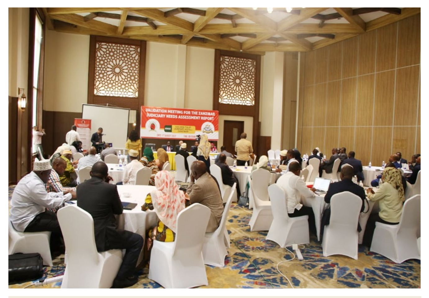
Participants following discussions during the Validation Meeting of Zanzibar Judiciary Need Assessment Report at Golden Tulip Hotel (Airport) on 01stAugust 2022.