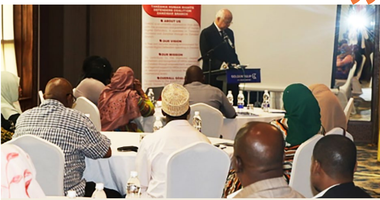
Minister of state, President's office, Constitutional, Law and Good Governance of Zanzibar Hon. Minister Haroun Ali Suleiman During validation meeting.