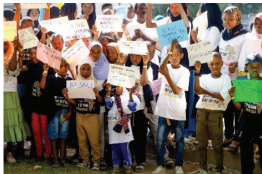
Children participating in various programs of the African Child Day supported by THRDC in both Tanzania mainland and Zanzibar.