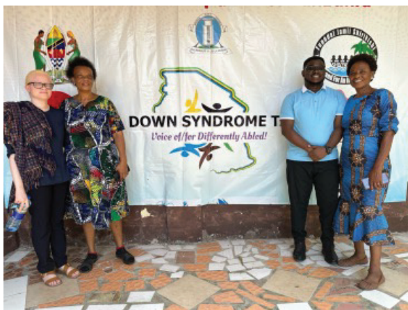
Some pictures of THRDC DDI Team during the visits and assessment of the Organisations of People with Disabilities in May 2024.

Earlier this year, THRDC established a desk for the Defenders with Disabilities Initiative (DDI) to support and empower human rights defenders with disabilities. From May 23–27, 2024, DDI visited Dar es Salaam OPDs to introduce the initiative, build connections, and understand their challenges. Despite their valuable work, these organizations face financial and systemic barriers. The meetings also explored new collaboration avenues that promise substantial benefits for human rights defenders and individuals with disabilities in the country.