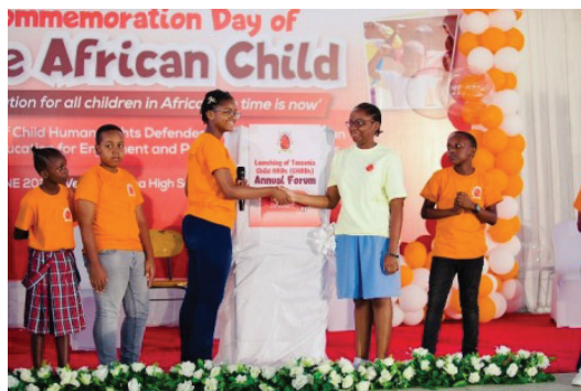
The launching of Child Human Rights Defenders Annual Forum and new elected leaders for the period of two years (2024-2026)