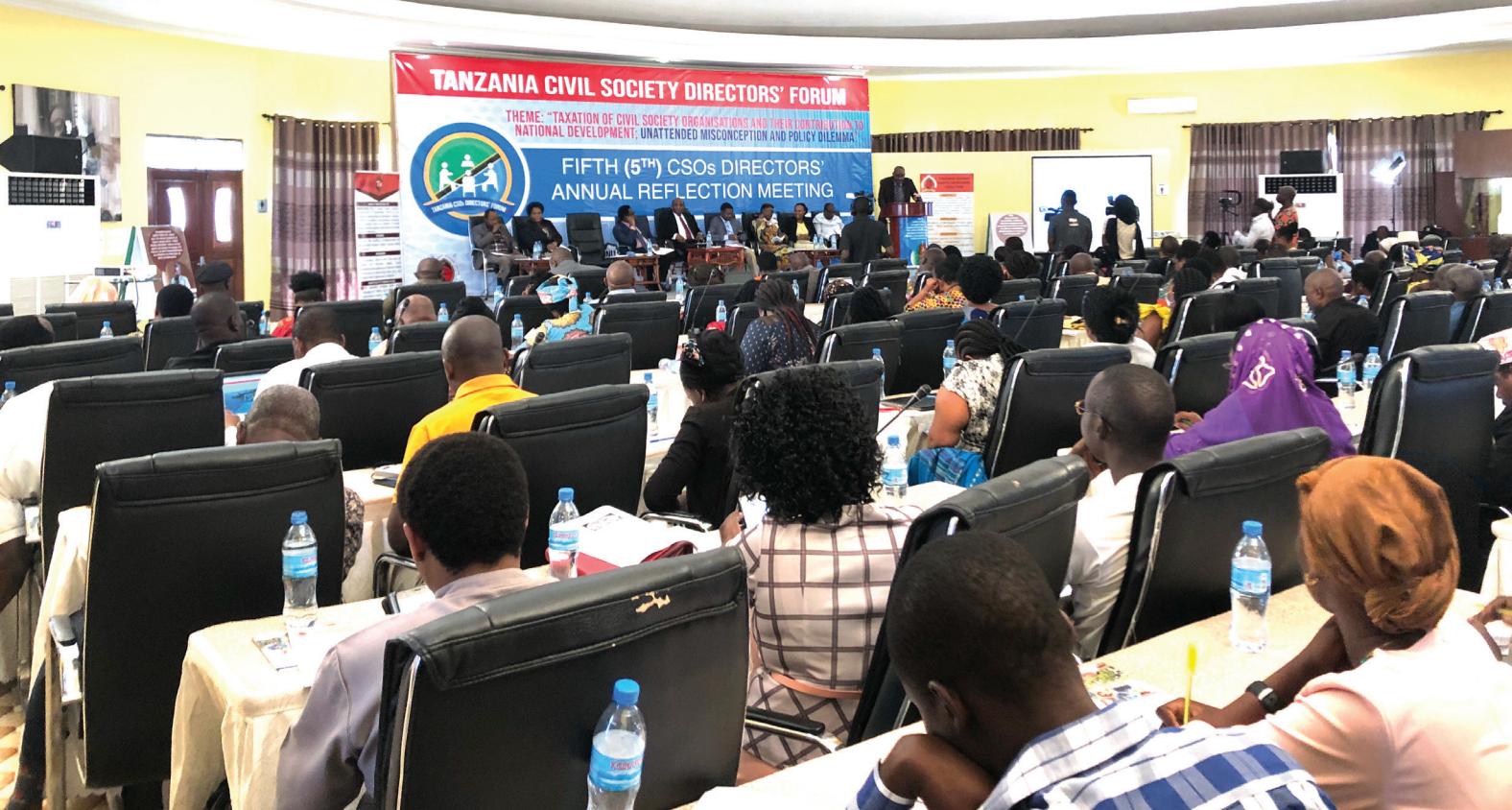
CSOs Directors and other invited guests listening attentively to the moderator during the session of the 5th CSOs reflection meeting.